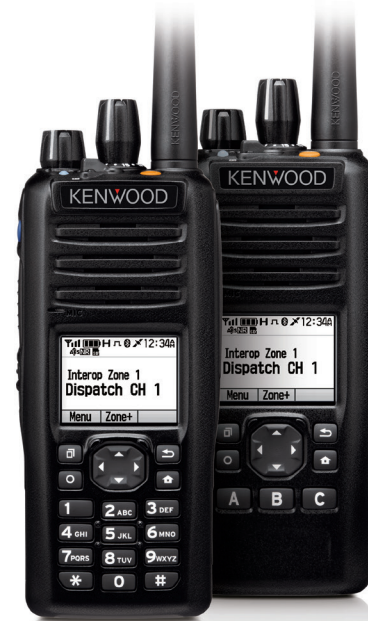
Full-Keypad & Standard Models