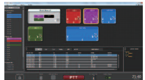
Dispatch: List Display

Specifications are subject to change without notice, due to advancements in technology. NXDN® is a trademark of JVCKENWOOD Corporation and Icom Inc. NEXEDGE® is a registered trademark of JVCKENWOOD Corporation. OpenStreetMap® is open data, licensed under the Open Data Commons Open Database License (ODbL) by the OpenStreetMap Foundation (OSMF). Microsoft, Windows, and SQL Server are trademarks, or registered trademarks of Microsoft Corporation in the U.S. and/or other countries. Intel and Core are trademarks of Intel Corporation in the U.S. and/or other countries. All other trademarks are the property of their respective holders.