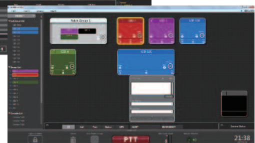
Main Dispatch screen