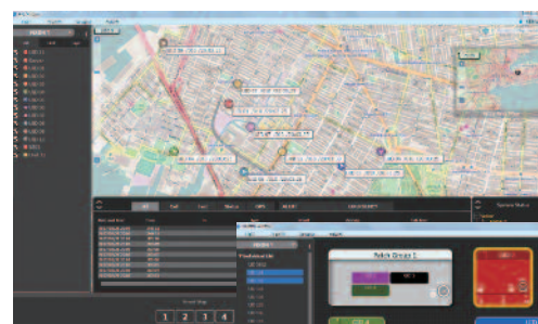
Main AVL screen

*System type and bandwidth must be met in order to patch calls.