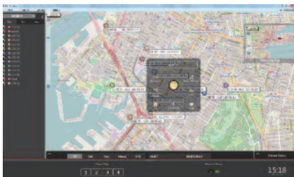
AVL: Unit Operation