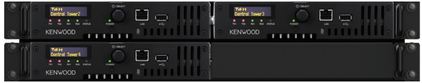
Example of rack mount options.